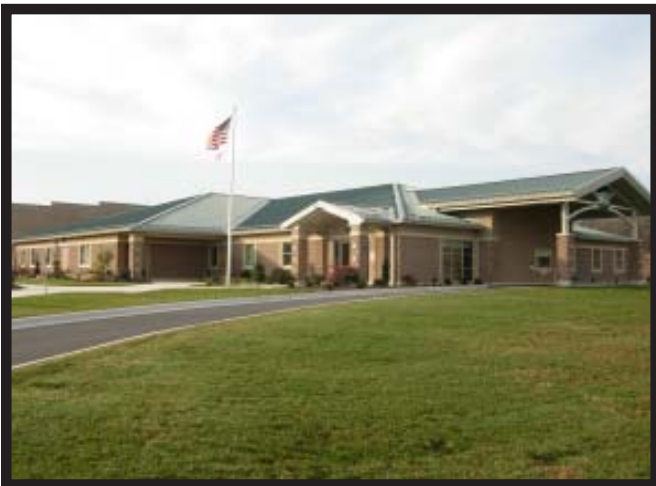
Commercial / Industrial Concrete Design Dubois Rural Electric Cooperative Owner: Dubois Rural Electric Cooperative, Inc. Mason: Arnold Masonry Architect: Universal Design Associates, Inc. Manufacturer / Supplier: Dubois County Block & Brick, Inc.