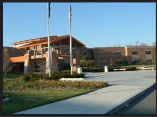
Educational Design Award Riverside Intermediate School Owner: Hamilton Southeastern Schools Mason: Ziolkowski Construction, Inc. Architect: Fanning Howey Manufacturer / Supplier: Edgewood Building Supply