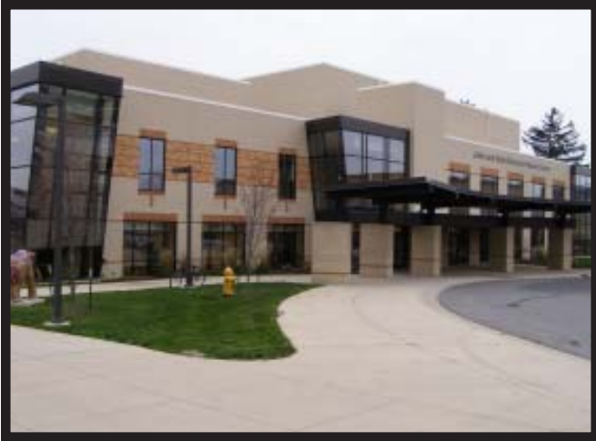
College / University Design Award The John and Ruth Rhinehart Music Center Owner: Indiana University Purdue University Fort Wayne Mason: Fetters Construction Inc. Architect: SchenkelShultz Architecture Manufacturer / Supplier: Masolite