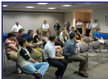
Visiting dignitaries of Ball State