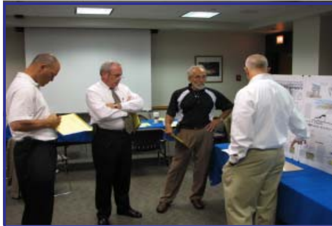
Judges reviewing Projects

stadium for the campus. Students worked first hand with Ball State Facilities and the Athletic department to understand the needs of the college and team. The students traveled throughout